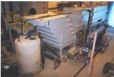
Packaged treatment plant in pre-fabricated building.