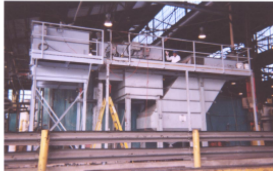
Metals treatment plant for a fortune 500 manufacturer.